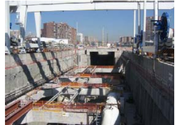
Illus. 5—The TBM launch chamber in Madrid