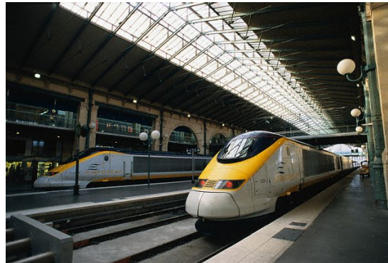
Illus. 4—Waterloo railway station in Channel Tunnel