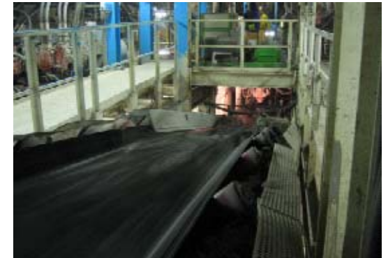
Illus. 6—Excavated material is transported through the rear of the TBM