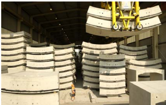
Illus. 2—Sections of the concrete tunnel wall before construction—each section weighs nearly 14 tons