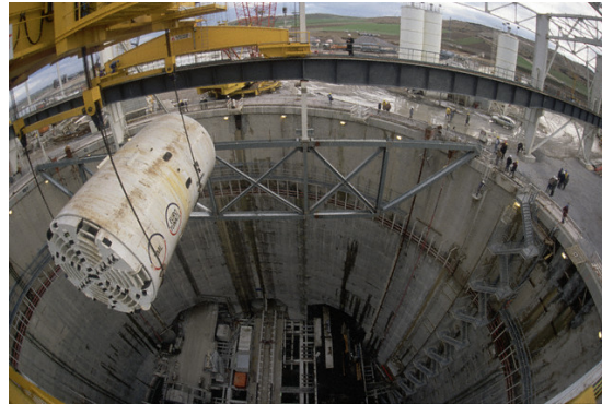
Illus. 3—One of 11 TBM's used in construction of the Channel Tunnel